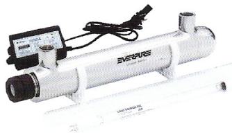
A: PFB-002 Ultraviolet Sterilizer