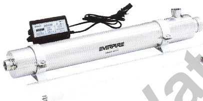
B: PFB-006 Ultraviolet Sterilizer