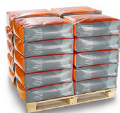
Polyethylene valve bags, 20 bags per pallet.