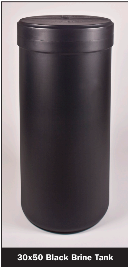
30x50 Black Brine Tank