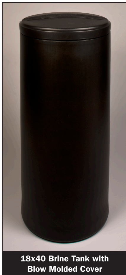
18x40 Brine Tank with Blow Molded Cover