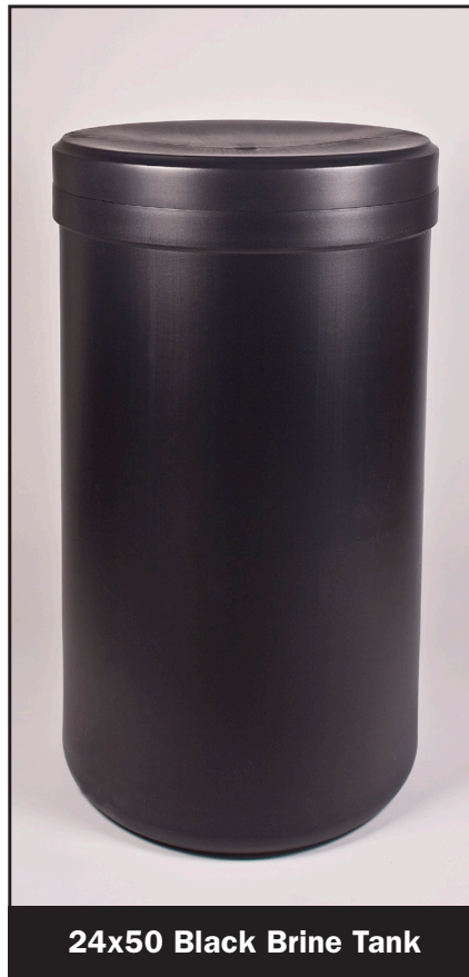
24x50 Black Brine Tank

Clack now offers both 24" and 30" round blow molded brine tanks. The introduction of the 30" diameter tank makes it the largest blow molded brine tank for commercial/industrial applications. Like the 24" round tank, the 30" tank is molded of high density polyethylene for exceptional stress and crack resistant properties. These tanks are ideal for industrial and commercial use and the 30" tank feature heavy wall thickness for increased durability.