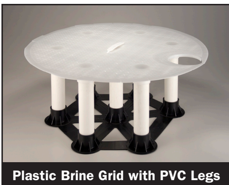
Plastic Brine Grid with PVC Legs