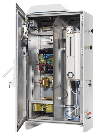
View inside: GSO 18 ozone systems