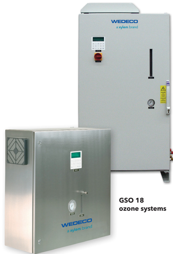
GSO 18 ozone systems